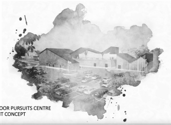
LEICESTER OUTDOOR PURSUITS CENTRE RE-DEVELOPMENT CONCEPT